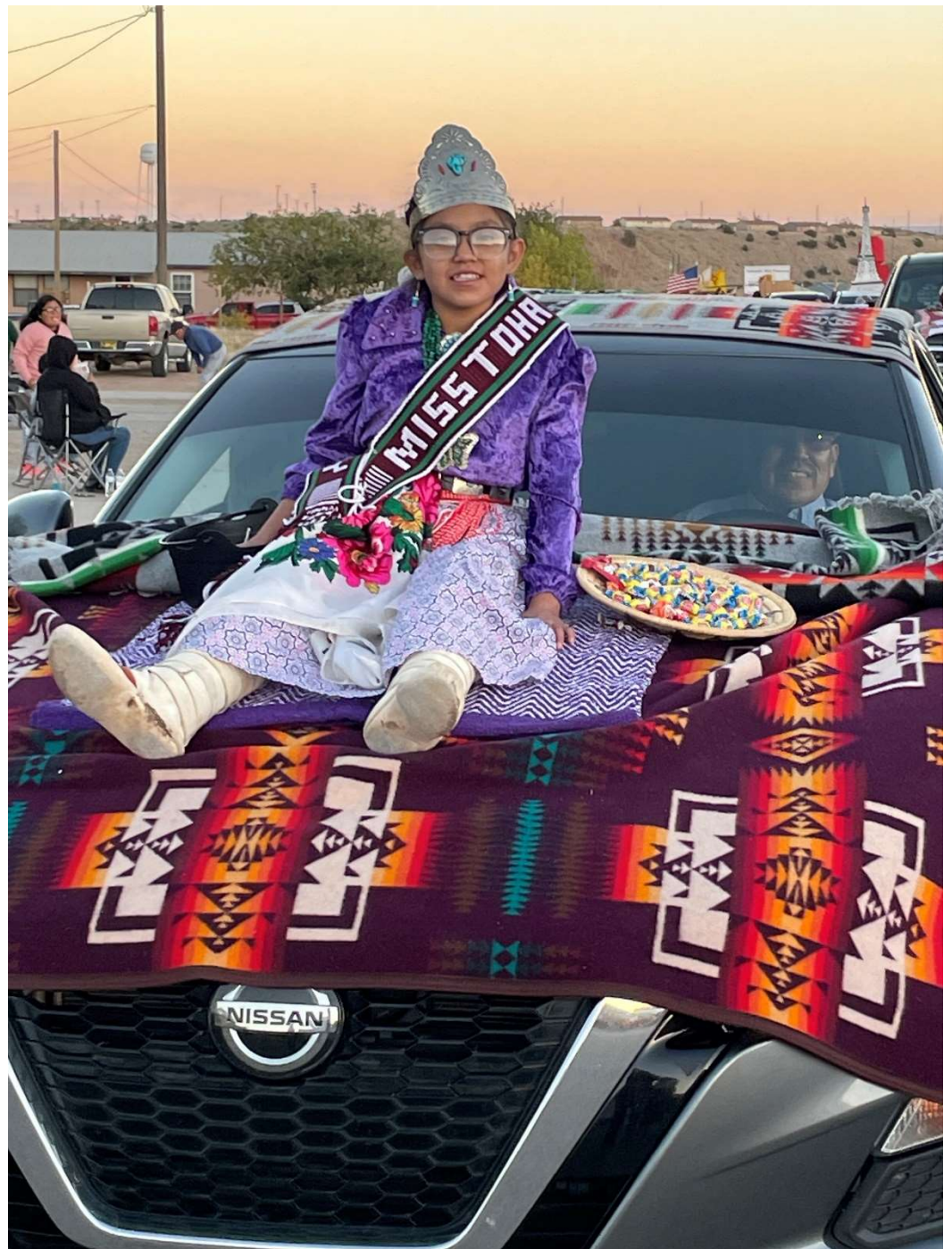
The Tohatchi Elementary Princess sits on a car throwing out candy to kids during the Homecoming Parade on Oct. 25.

As the echoes of laughter and cheers linger, we look forward to next year's Homecoming Parade, eagerly anticipating the creativity and camaraderie that will once again grace the streets of Tohatchi. Until then, let the memories of "A Night in Paris" continue to illuminate our community with warmth and unity.