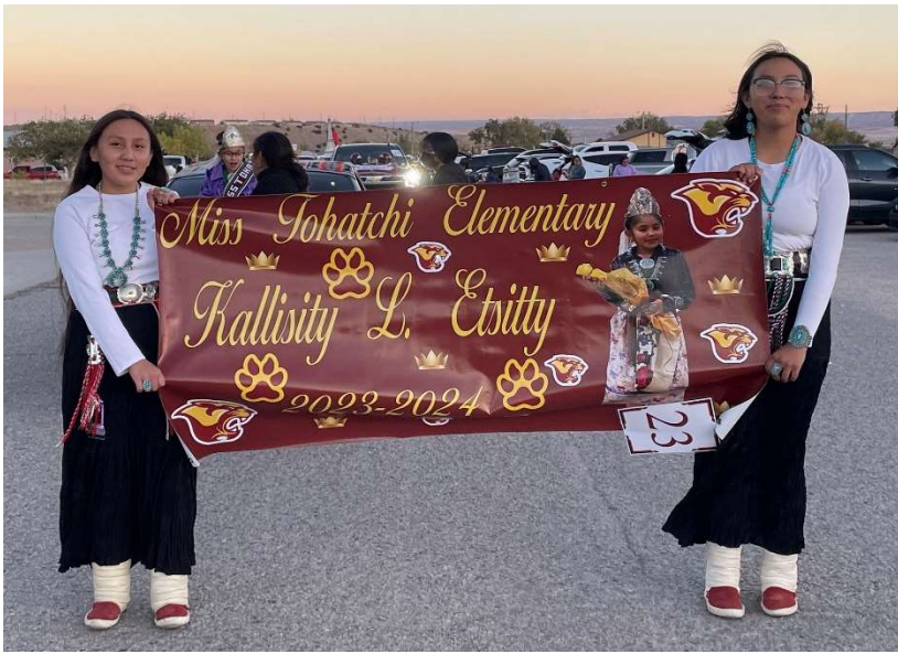
Two Tohatchi High School Students carry a banner for the Tohatchi Elementary Princess at the Tohatchi Homecoming Parade on Oct. 25.